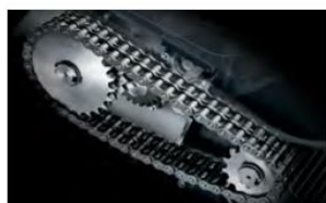
SUPER POTENTIAL POWER SYSTEM