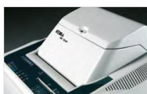
LOCKABLE COVER (LK)

馬達過熱保護 紙張指70gsm / M2 / A4 電壓及紙質差異會影響碎紙能力