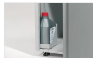
AUTOMATIC OILING SYSTEM